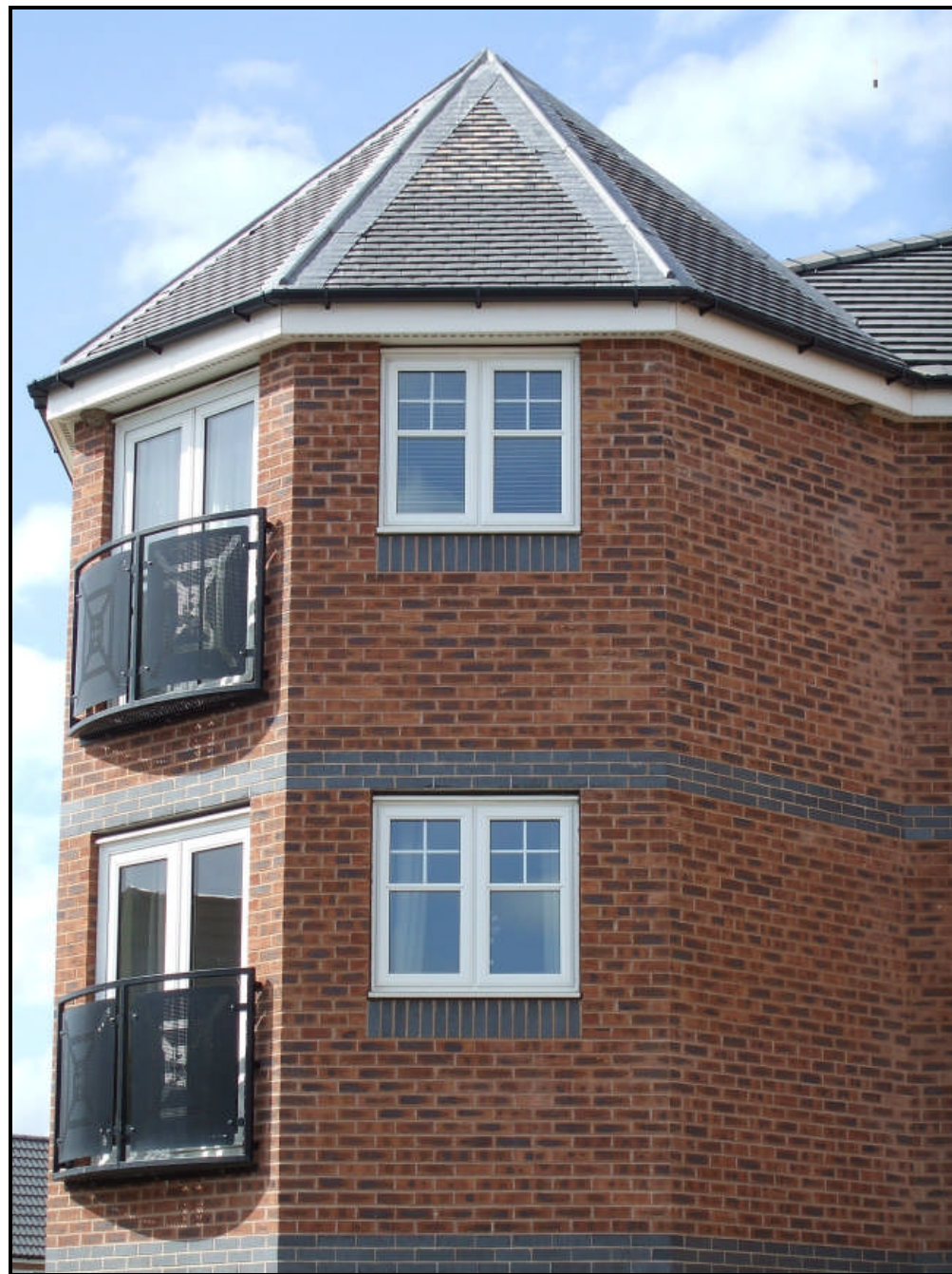
Newly built affordable housing in The National Forest.