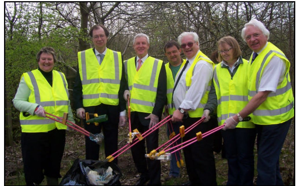
Members and the Corporate Management Team launch the Cleaner South Derbyshire campaign.

According to the 2006 Best Value User Satisfaction Survey just over two thirds of respondents were satisfied that the Council keeps its land clear of litter and refuse. Over the last three years a series of ‘clean up’ projects have been carried out across Swadlincote, Woodville and Newhall. These projects were carried out to improve the environment of the areas and to reduce the potential for criminal damage.