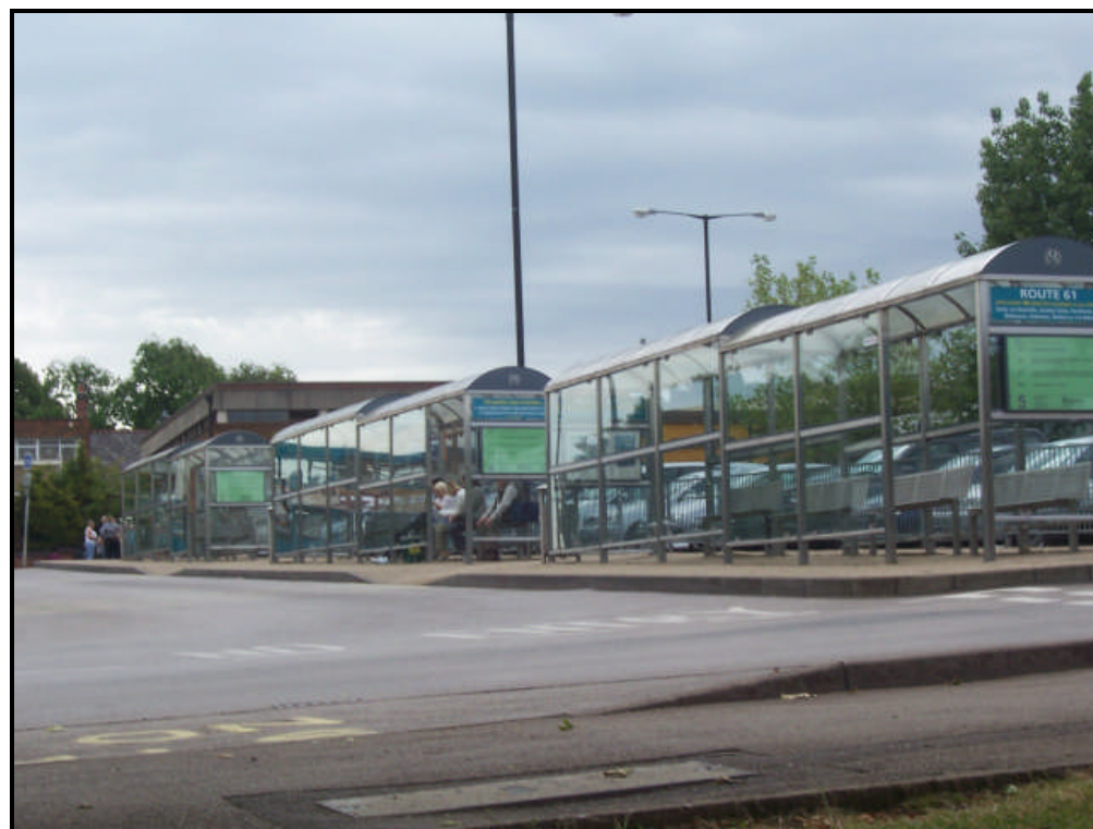
Free car parking and the centrally located Swadlincote Bus Station.

"Transport (public services) is very lacking, we need a direct link to Nottingham, Loughborough and Leicester".