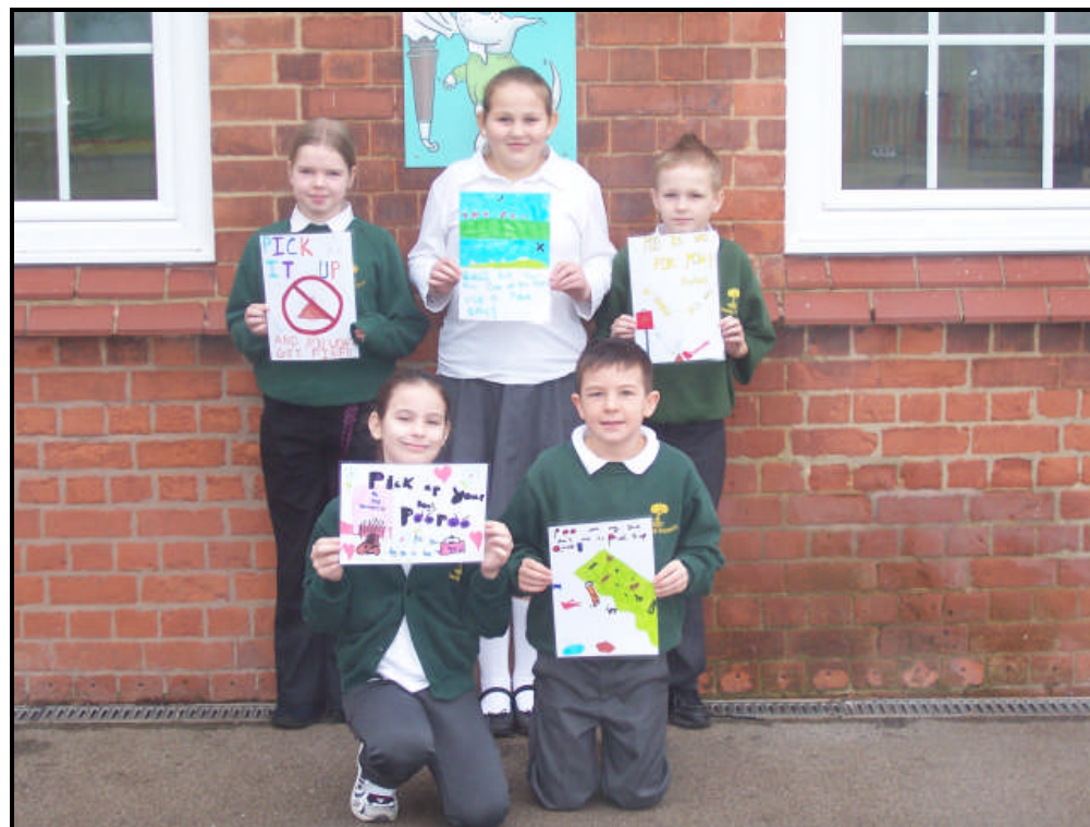
Pupils from Overseal Primary School involved in promoting a cleaner South Derbyshire.

“It is very important for children to be involved in groups instead of playing on their playstations alone in their bedrooms”.