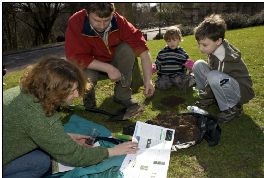
Children's activities in the outdoors.