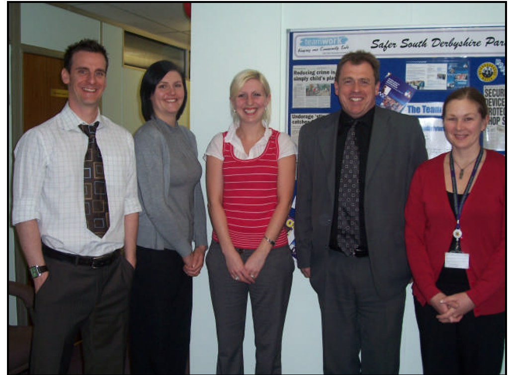
Our Safer Communities Team at South Derbyshire District Council are dedicated to making our communities safer places to live, work and visit.

“Fear of crime and anti-social behaviour is relatively high in South Derbyshire and partners need to work together to reduce the issue”.