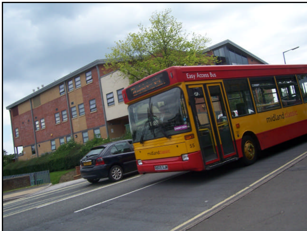
Free moving traffic on Civic Way, Swadlincote.

As highways, roads and transport is a function of Derbyshire County Council we have informed their countywide strategy but we are delivering some key actions locally.