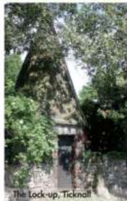
The Lock-up, Ticknall

The Lock-up was built in 1809 at a cost of £25 19s 11d to house vagrants, drunks and paupers on a temporary basis. Reputedly the kitchen back door key of the Staff of Life public house also fitted the local lock-up for drunks!