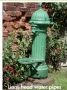
Lions head water pipes

There are 14 'lions head' water pipes scattered through Ticknall, which were provided by the Harpur Crewe family in 1914. Before then water was carried from local wells or springs. The taps fell into disuse in the 1960s when mains water was installed. Some of them are still in working order.